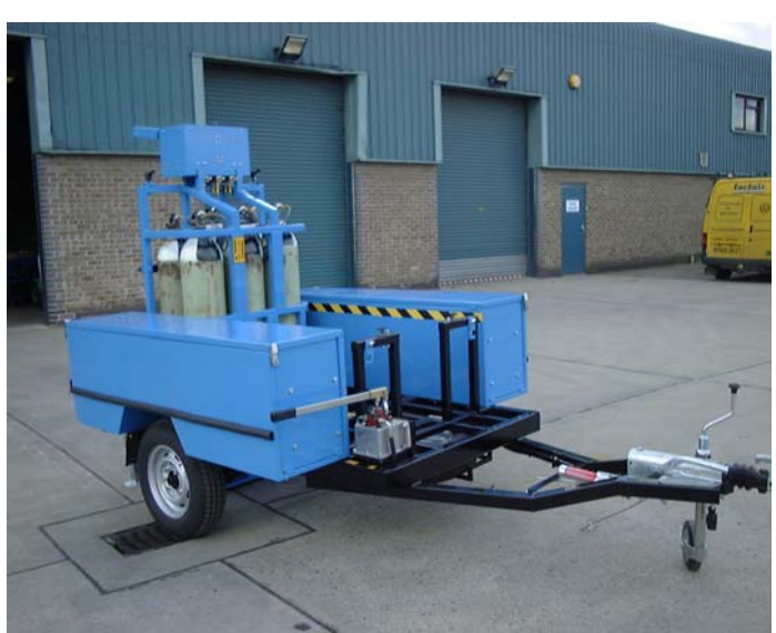
Special Trailair with hydraulic cradle rotation system and side storage pods