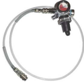
High Pressure Regulator Up to 300 bar