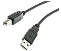
USB A to Male USB B Connection Cable