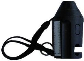
F2187 Tube Tip Cutter