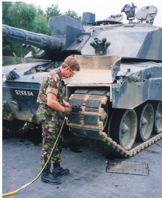
Air powered needle scaler at work on a Challenger 2 Main Battle Tank