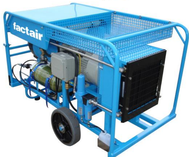
Pictured above – BA450EX Zone 1 BA Compressor